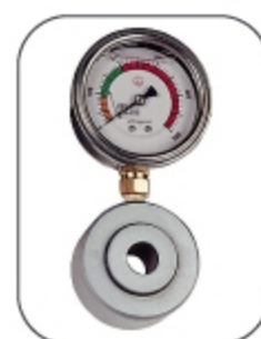
Hydraulic saw blade tension gauge