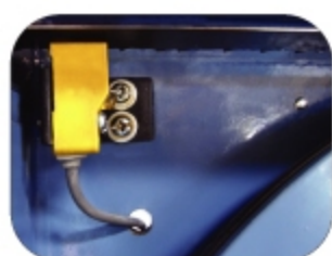
Safety device for saw blade breakage